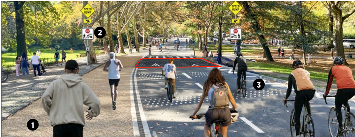
P. 54, Item #2, CP Drive Safety and Circulation Study, NYCDOT, 10/24

First, we call on you to forgo installation of "tabletop crossings" as depicted in item #2 of p. 54 of the Central Park Drive Safety and Circulation Study .